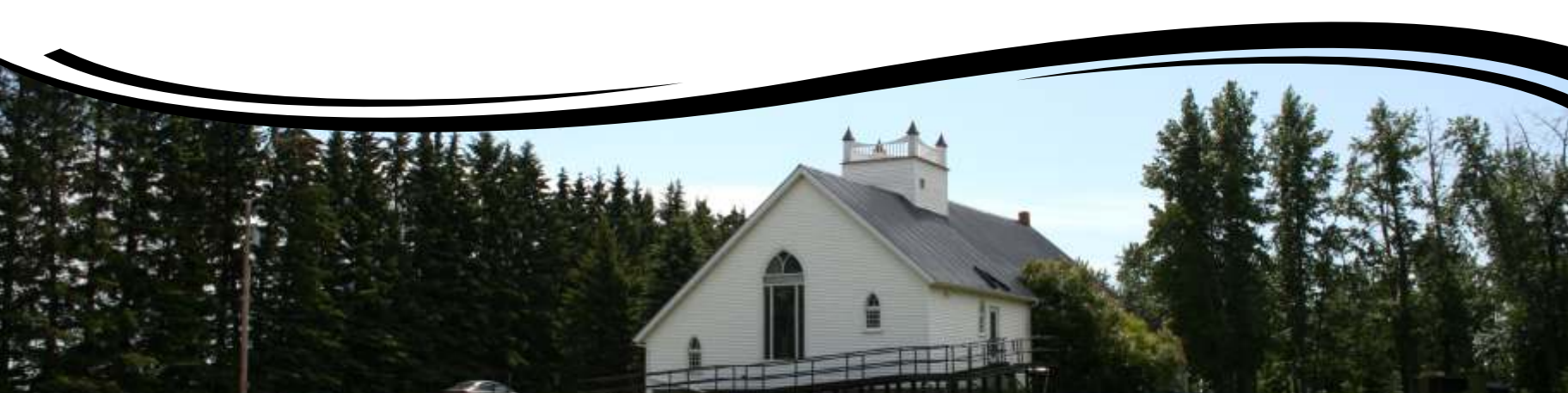
Photo: Rabbit Hill Baptist Church, Edmonton AB (oldest NAB church in Alberta)

If you'd like to explore Taylor Seminary but are unsure of which program to choose, you may apply as an unclassified student and experience first-hand the many possibilities for further or continuing education.