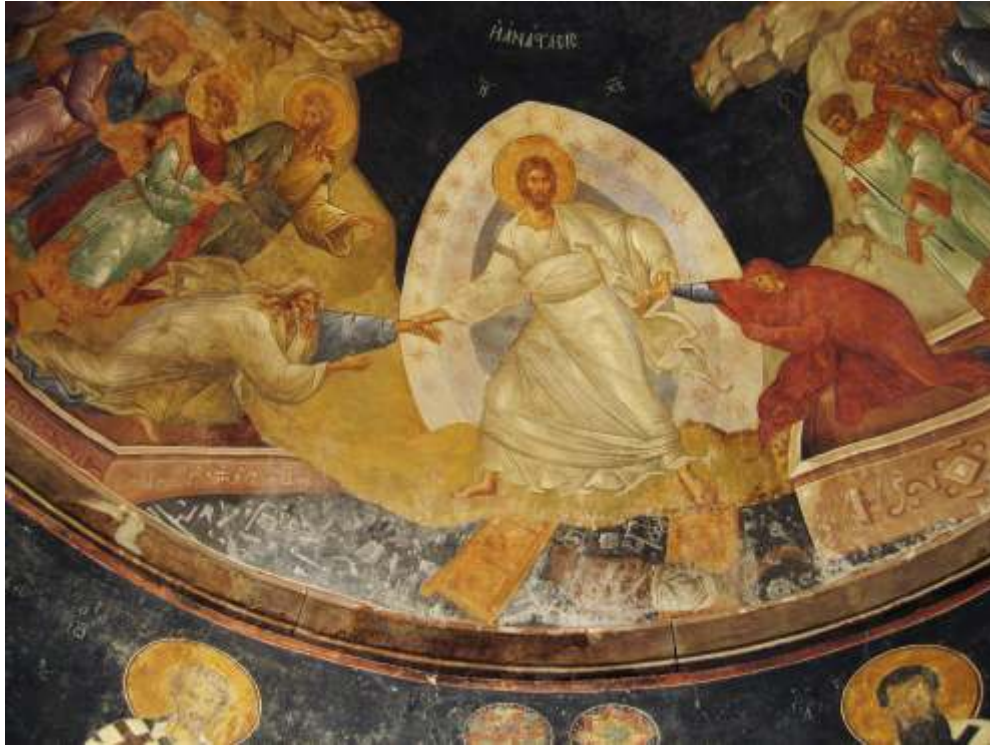
The Anastasis ("Resurrection") Fresco (14th Century), This fresco is painted on the ceiling of The Chora Church in Istanbul, Turkey